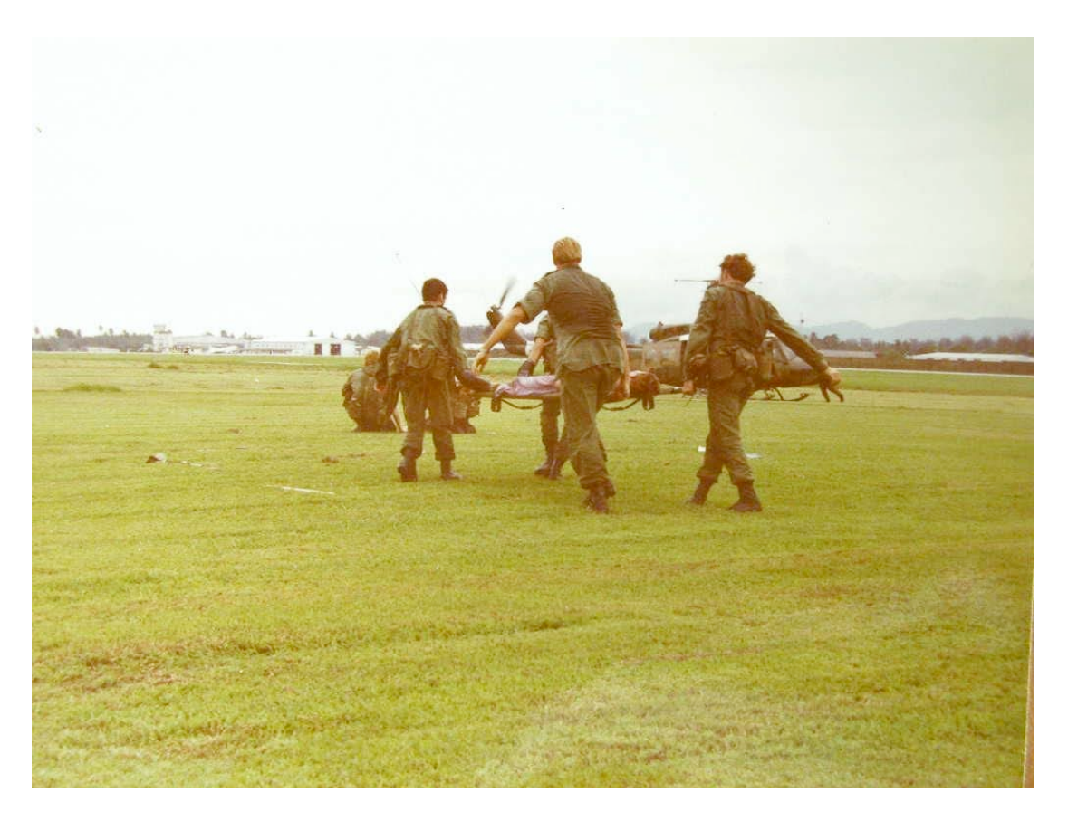
RCB Casualty evacuation training at Butterworth - 1974

Within the RCB there was a real perception and expectation that any enemy actions against the Base would result in casualties.