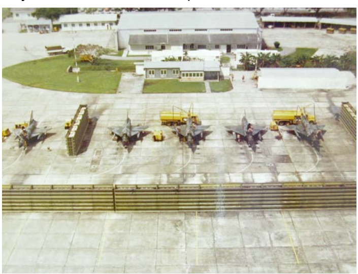
RAAF Flight-Line Butterworth 1979